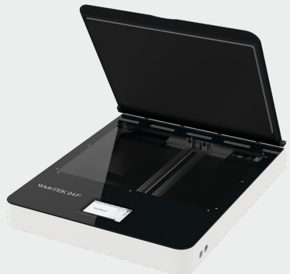
Scratch resistant glass plate enables scanning oversized originals